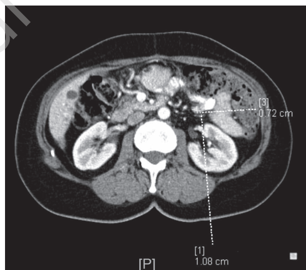
FIGURE 2. CT scan of the chest and peritoneum – 3.01.2019 r.

The FTD/TPI intake was withheld. An urgent tomographic examination was commissioned, which was carried out on August 5 th , 2019 (a month after discontinuation of FTD/TPI), where progression of metastatic changes was observed, mainly in the area of the abdominal wall. During this time, CEA increased from 230 to 1056 ng/mL (within a month) and neuropathic abdominal pain appeared. Analgesic treatment was set up and it was proposed to include another line of chemotherapy – FOLFIRI. The patient is currently continuing treatment with the above schedule, she obtained significant regression of the CEA marker after just one month of treatment and reduced abdominal pain.