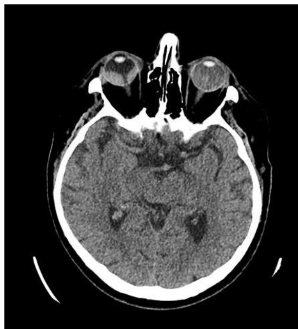
Figure 2. CT scan of the head without contrast status as of December 2023.

The patient underwent an ophthalmological consultation due to observed changes.