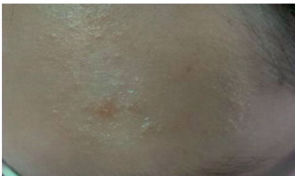
FIGURE 1. Follicular mucinosis with plugged hair follicles in a 15-year-old girl.

Basing on the clinical picture, the patient was diagnosed with follicular mucinosis. The treatment offered included strong topical corticosteroids once a day and isotretinoin