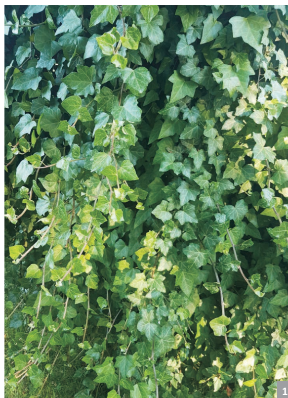
Figure 1. Ivy shoots hanging around a tree trunk.

In Poland, the common ivy grows in deciduous forests and in lower mountainous locations. The occurrence range of this plant species covers the entire area of Europe except Scandinavia. The eastern boundary of the geographical range is located in Poland [2]. H. helix has been protected in Poland for many years but is not protected at present.